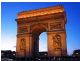
Arche de Triomphe

Paris, the capital of France, is located in northern France on both banks of the Seine River, 145 km (90 mi) from the river's mouth on the English Channel. A total of 2,135,300 (2002) inhabitants live in Paris proper, and almost 11 million persons (1999) live in greater Paris (the Ile-de-France region), which is one of Europe's largest metropolitan areas. A city of world importance and the business, historic, intellectual, diplomatic, religious, educational, artistic, and tourist center of France, Paris owes its prosperity in large part to its favorable position on the Seine, which has been a major commercial artery since the Roman period.