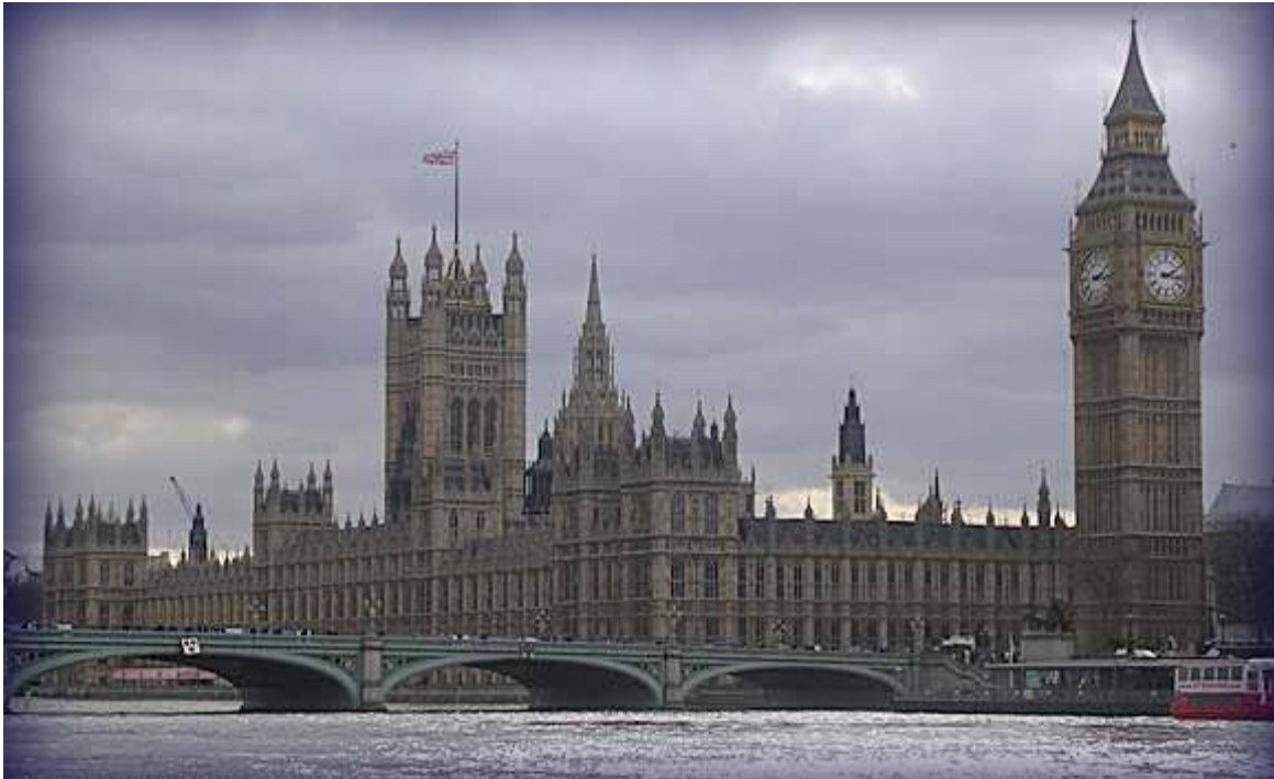
The House of Lords and Big Ben

London has been called a ‘world in one city’ and that’s not just empty rhetoric. The brilliant feat carried off here is that while immigrants, the city’s life blood, continue to flow in and contribute their energy and cultures to the capital’s already spicy melting pot, London nevertheless feels quintessentially British, whether it’s those boxy black cabs, the red double-deckers or those grand symbols of Britain – the mother of all parliaments at Westminster, the silhouette of Tower bridge above the muddy Thames or the already world-famous London Eye, barely a decade old.